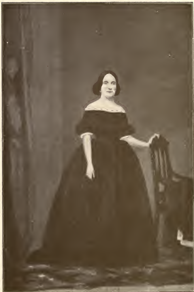
MRS. JAMES CHESNUT, JR.